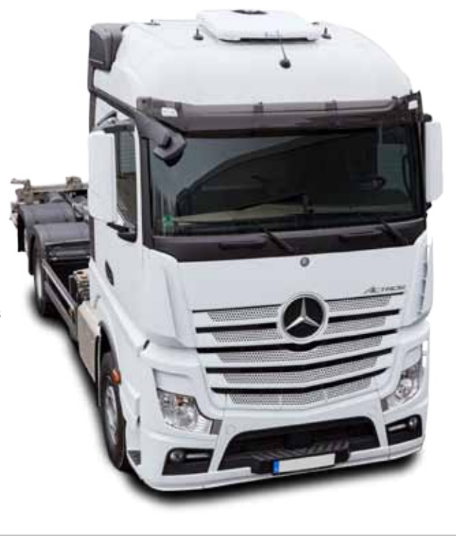
Vehicle-specific installation kit

small parts. Tip: in the case of Mercedes models, depending on the standard equipment, please ensure the truck has the optional electrical distribution accessory installed.